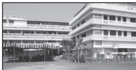
Jack Nalle Institute